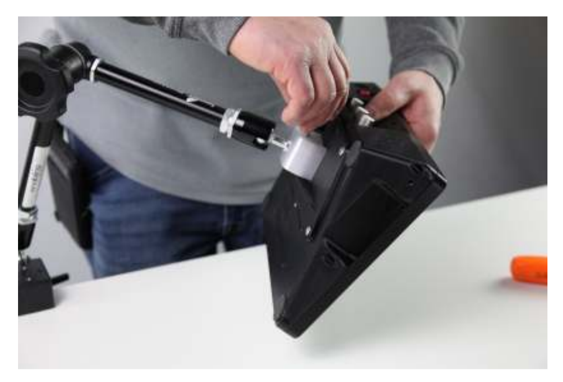
Option 2 is for mounting to a gooseneck mounting system with a \frac{1}{4} -20 threaded female socket. Attach your device's mounting tray to the adapter and secure with the two Phillips head screws. Thread the adapter with the \frac{1}{4} -20 screw into your gooseneck. Place your device into the mounting tray and press down to lock in place. See photos.

Next, line up the thumbscrew with the flat spot on the mounting arm's post. You will need to back the thumbscrew almost all the way out to allow the block to seat all the way down on the post. Once this is done, tighten the thumbscrew to secure the mounting plate to your mounting arm.