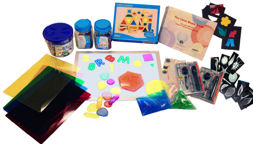
Light Box Kit #3114 from Enabling Devices