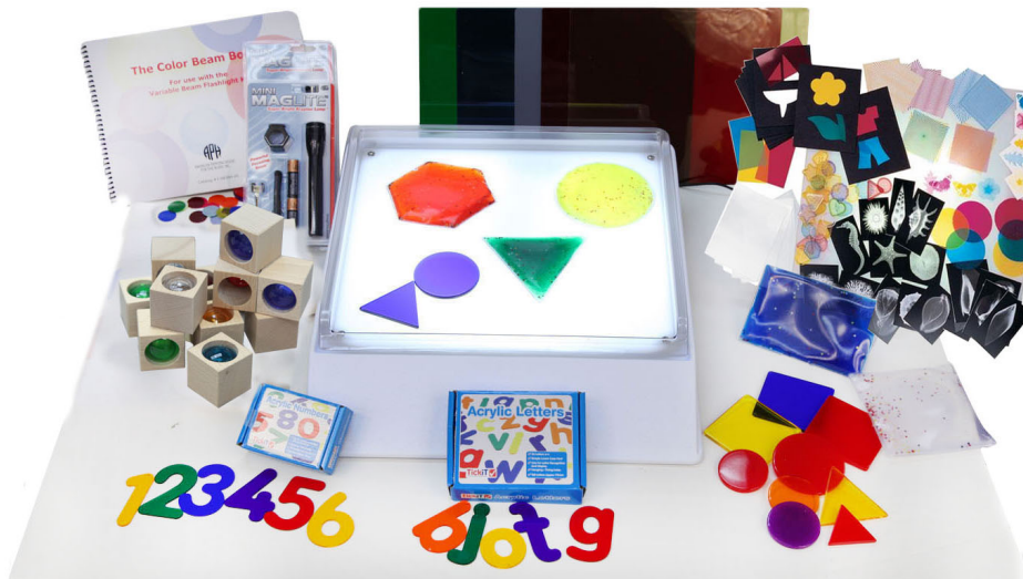
Light Box Kit #3114 from Enabling Devices