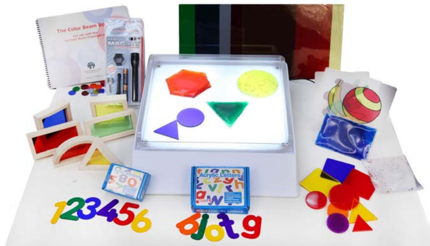
Light Box Kit #3114 from Enabling Devices