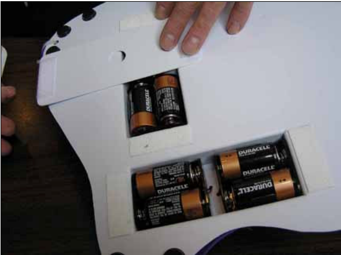
Operation No. 1

1. Carefully turn over unit to reveal battery compartments. Remove the cover then, observing proper + & - polarity, install six C size batteries into the holders. Alkaline batteries are recommended because they last longer. Do not use rechargeable batteries because they supply lower voltage and the unit may not perform as well.