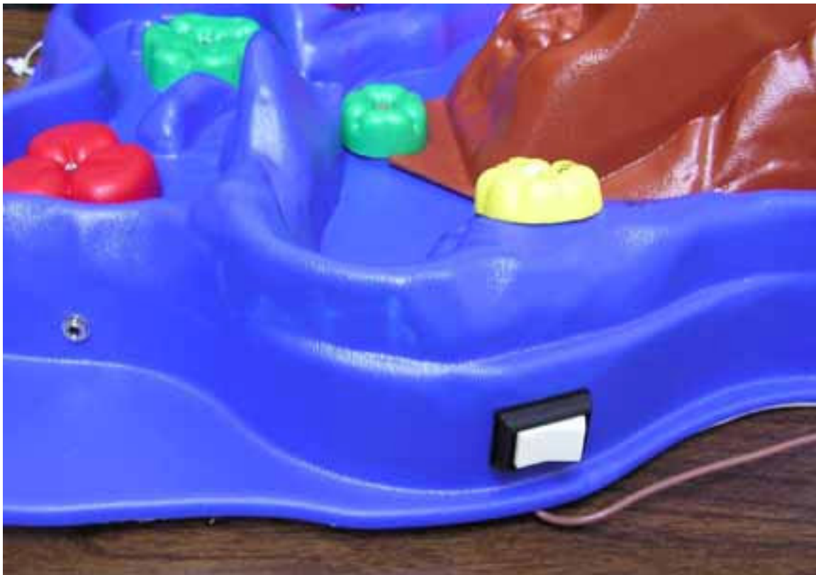
Operation No. 2

Table Top Clamping: The four corners of the base are made to be used if desired with C-Clamps Not included for secure mounting. Tighten C-Clamps just enough to hold unit securely. Over tightening of clamps will cause damage or crack base, and void your warranty.