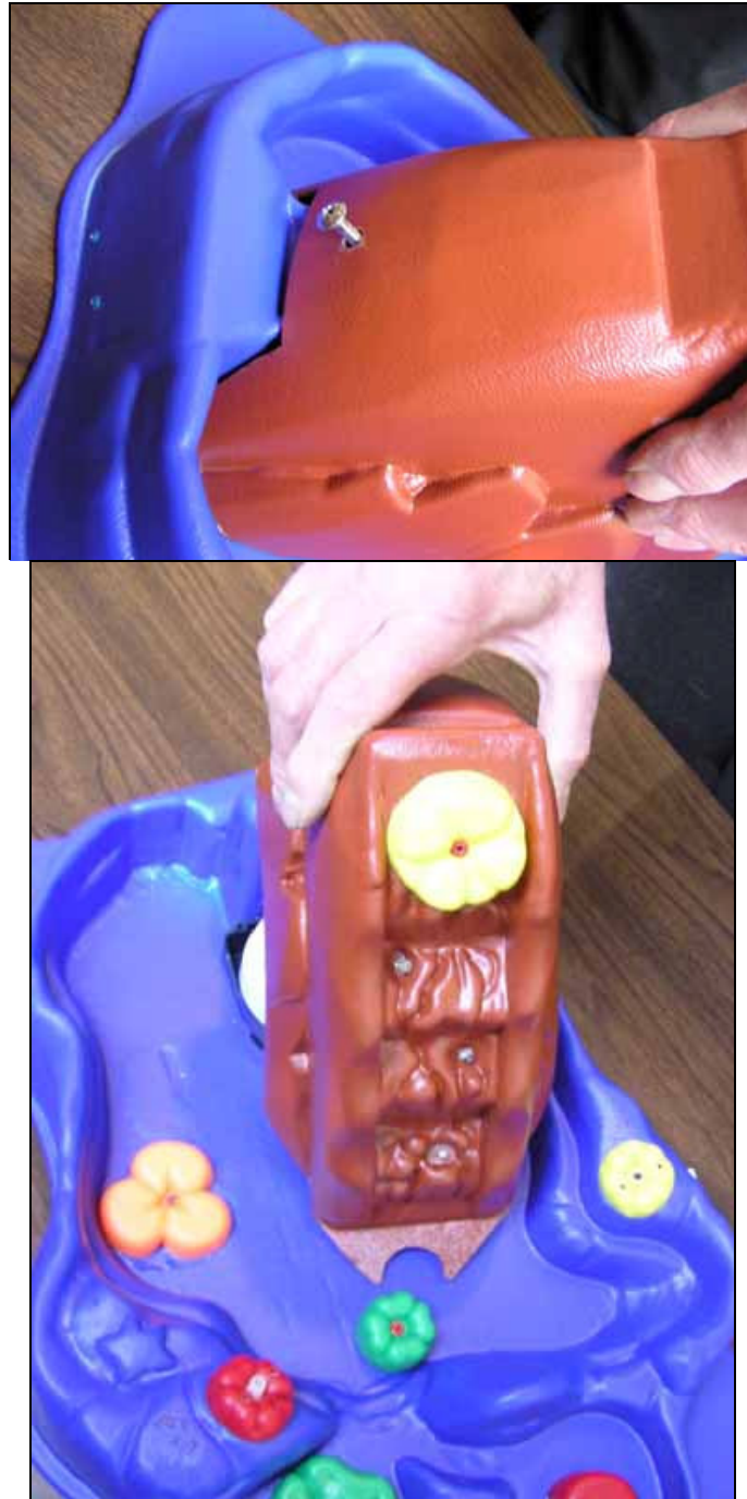
Operation No. 3

3. The water flow rate has been factory set for optimum performance, however if need be it can be adjusted following these simple steps. To adjust the water flow, the screw in the back of the volcano must first be removed. Using a Phillips head screwdriver remove the screw. Next lift the volcano up from the back, while pulling it slightly towards you, just enough to clear the front mounting tab on the bottom front of the volcano. See photo.